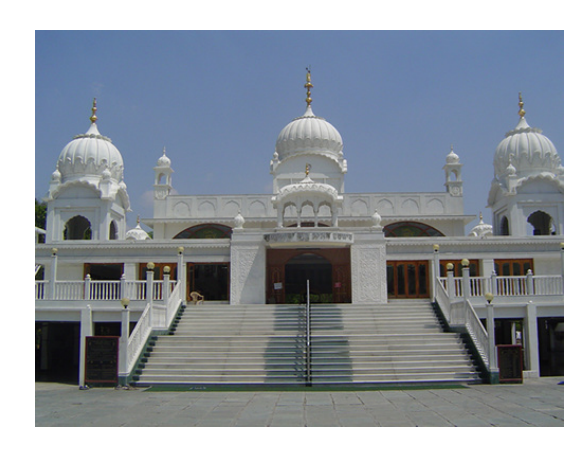
The Guru Nanak Darbar (a Sikh palace in Pune)

Each NAN will be contacted directly with a request to send two delegates, the coordinator or another NAN representative and a patient representative to the meeting in India. All delegates of the Patient Advocacy Meeting will be automatically registered for the Network Conference as well. The official invitation and necessary registration information will be sent in May, so please keep the dates and watch for further announcements on www.bjdonline.org